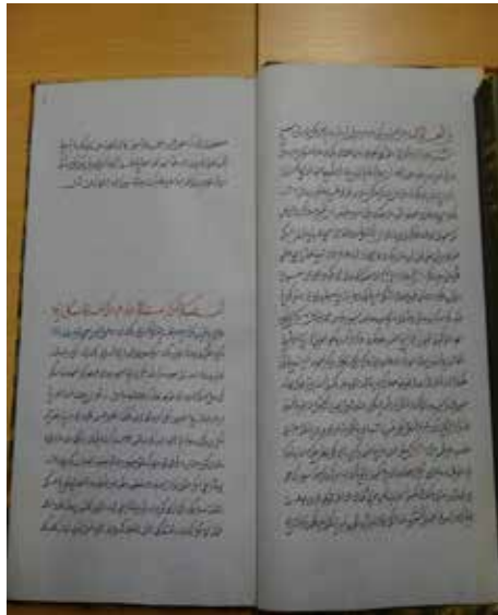
Figure 7 Adat Segala Raja-raja Melayu (SOAS MS 21042).