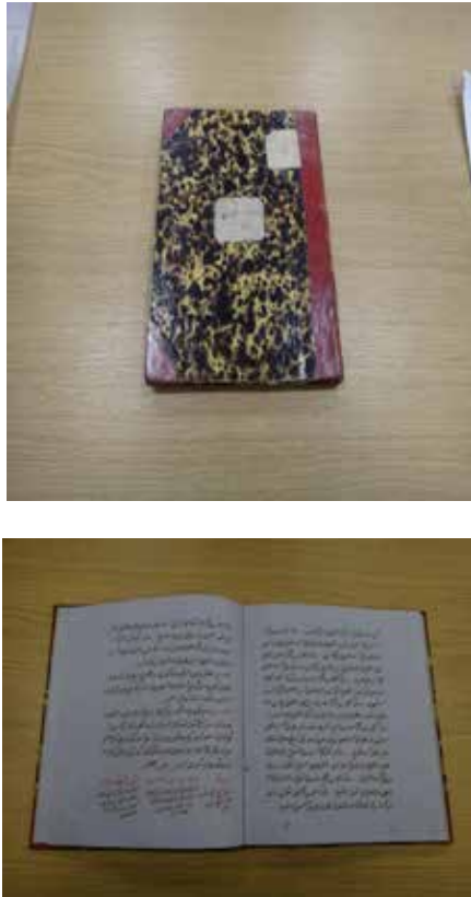
Figure 8 Adat Segala Raja-raja Melayu (RAS Maxwell 60).

that is black and yellowish in colour, and consists of 119 pages. On the external cover is written the title of the manuscript: “ Ini hikayat raja-raja berputera ” [“This is the story of Sultans and their Descendants”]. The manuscript measures 20.2 cm x 16.2 cm in black and red ink. The paper is blue in colour, unlined and similar to the paper used in MS 21042 which is kept in SOAS. However, the Maxwell 60 manuscript does not state clearly where the manuscript was copied and who the copyist was. Hence the MS 21042 kept in SOAS is still the best manuscript that can be used as the basis for publication of a new version of Adat-adat Raja-raja Melayu . Other manuscripts can be used as comparison in order to produce an edited version that is more critical and academic.