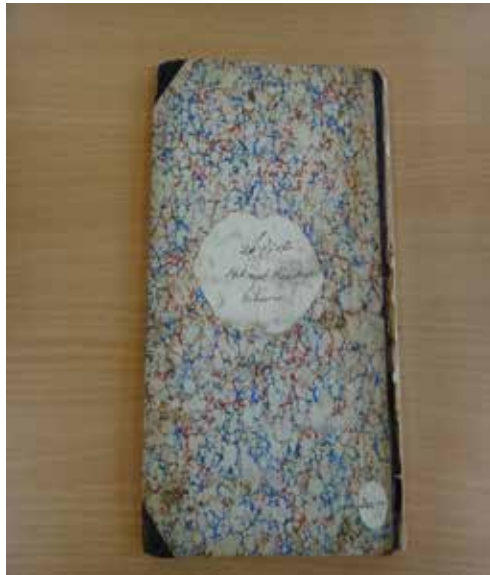
Figure 4 Hikayat Raja-raja Kahwin (SOAS MS 36497).