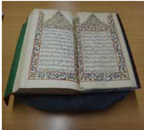
Figure 5 Hikayat Hang Tuah (SOAS MS 37075).