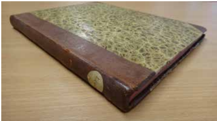
Figure 3 Taj al-Salatin (SOAS MS 21039).