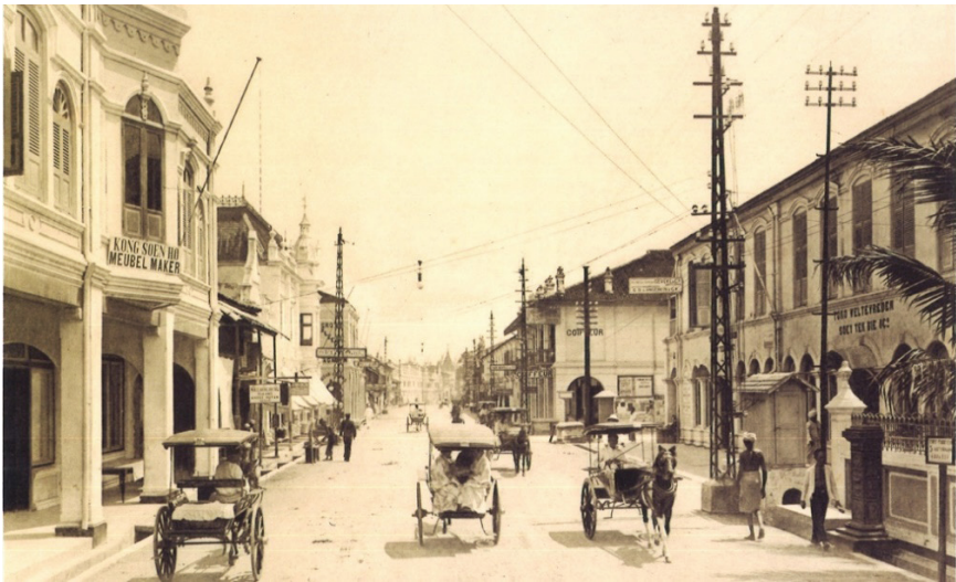
Figure 1 Kesawan, the well-known business district of Medan, in the early 20 th century.