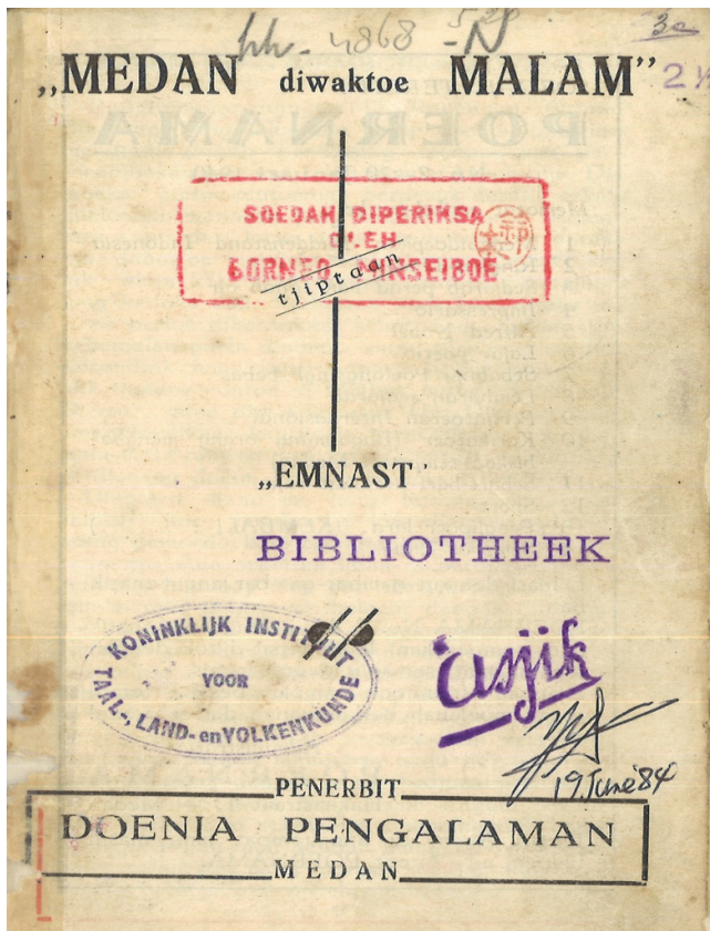
Figure 10 A red stamp with the wordings “SOEDAH DIPERIKSA OLEH BORNEO MINSEIBOE”, being the stamp of approval from the Japanese military authorities (in Kalimantan). (Source: Emnast, 1940, inner cover).

Many other interesting matters about the writers of roman Medan could be discussed further, such as the paradoxes of a writer from an Islamic background writing such novels (Jedamski, 2007). At a time of “bandjir roman” [“a flood of popular novels”], some people felt it was inappropriate and this was reflected in the polemics of the magazine Pedoman Masyarakat , which was under the leadership of Hamka and was one of the reading materials of intellectuals in Medan at the end of the colonial period. Some of the polemics were recorded in the books of Zainal Rasjid (1951 11 ).