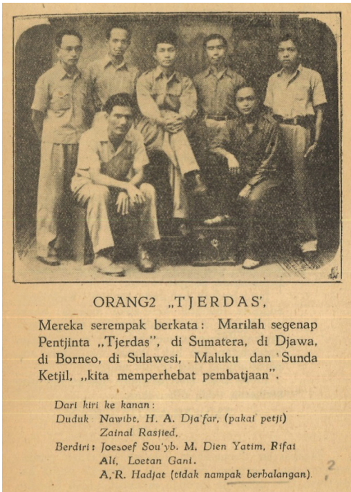
Figure 4 The staff of Penerbit Tjerdas, the publisher of the Loekisan Poedjangga series.

and then in 1944, when a new series with the same name appeared. This can be seen from the numbering of the series that accompanied every edition. Whether or not the second appearance of the Loekisan Poedjangga series (1944) is connected to Joesoef Sou’yb from the group that established the first series after its first three years is unclear. He became the Editor-in-Chief of Loekisan Poedjangga from 1939 to 1942. If taking into consideration its second appearance, then Loekisan Poedjangga is the most long-running series compared to the others.