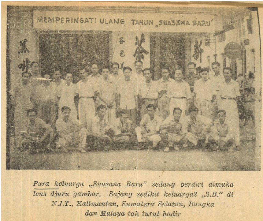
Figure 6 A gathering of the editorial team of Suasana Baru and its representatives that took place in June 1949 in Medan.