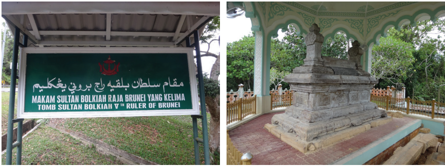
Figure 4 Two photos of the mausoleum of Sultan Bolkhiah (Nakhoda Ragam) at the Royal Brunei Mausoleum in Jalan Tutong, Bandar Seri Begawan, Brunei Darussalam.

and explorations of the Malay World, reaching Java, Melaka and several islands around Borneo. Low (1998, p. 5) records the following: