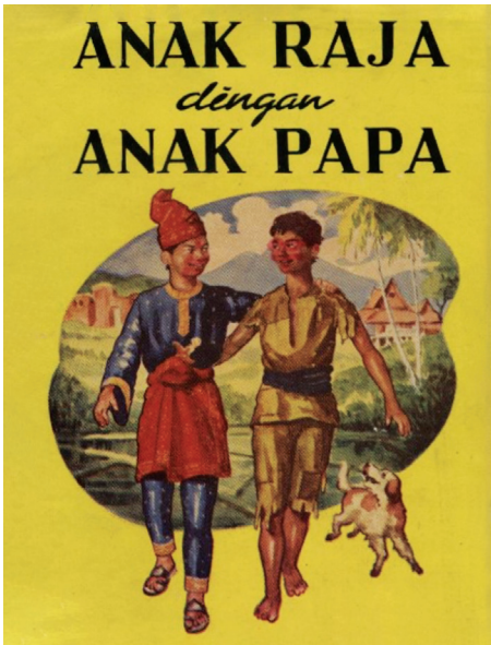
Figure 1 The first translation of The Prince and The Pauper into Malay, which was published in 1958.