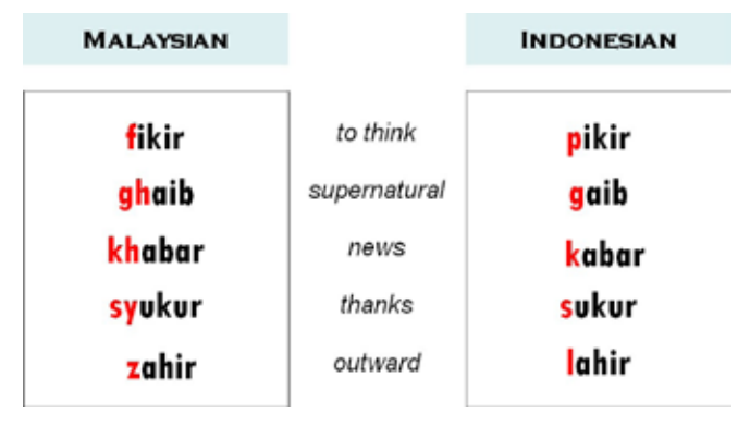
Figure 2 Differences of Roman spelling in Arabic loanwords between Malaysian and Indonesian.

Some of the differences in spelling are shown in Figure 2, where the dissimilarity in the romanized spelling is apparent even though the words have the same meaning. One interesting fact to consider is that all the words listed in Figure 2 are Arabic loanwords. This observation shows that the dissimilarity of the romanized spelling in both languages is related to the use of the Jawi script where Arabic loanwords are concerned.