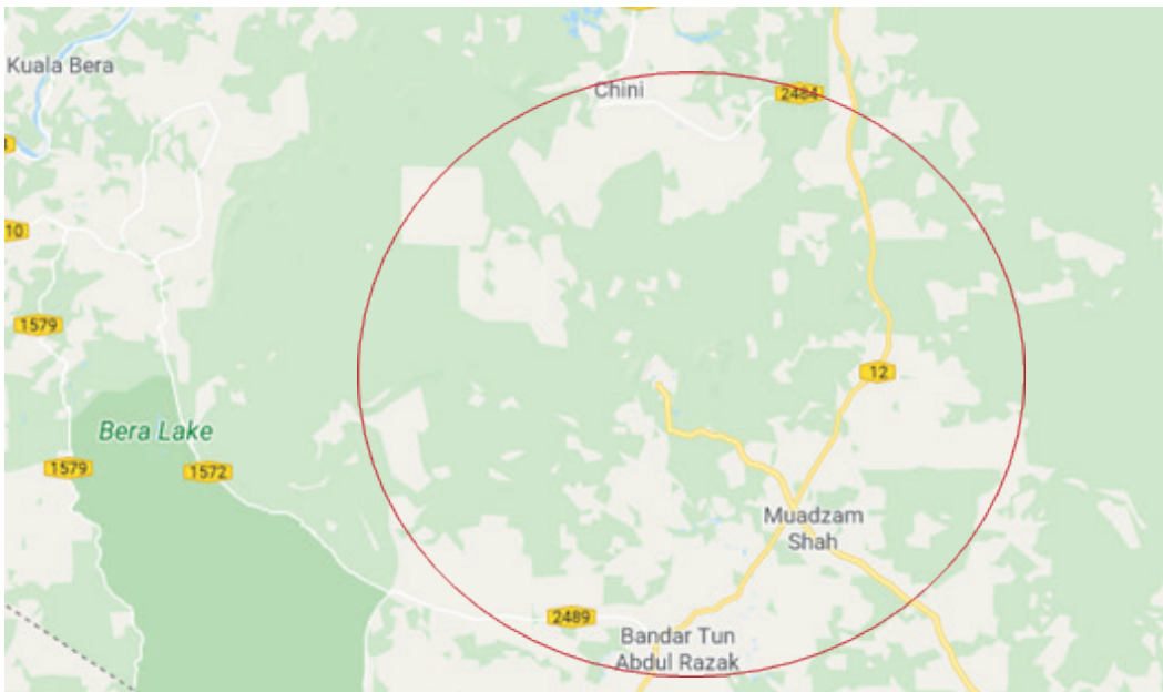
Figure 2 Map of Desa Jakun, Semelai and Temuan Muadzam Shah, Pahang. (Google Map, https://www.google.com/maps/@3.0926464,102.8231032,10z , n.d.)