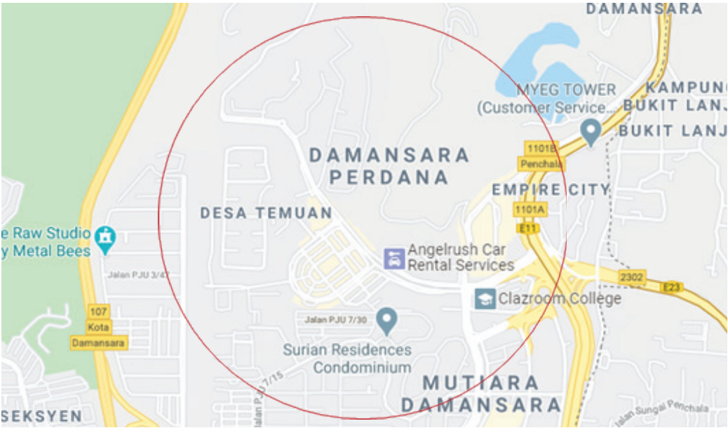
Figure 1 Map of Desa Temuan, Damansara Perdana. (Google Map, https://www.google.com/maps/@3.1701528,101.6009308,15z , n.d.)